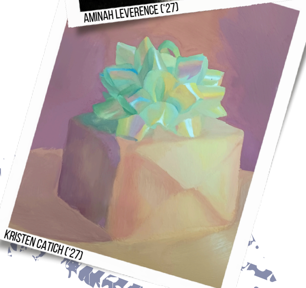
KRISTEN CATICH ('27)