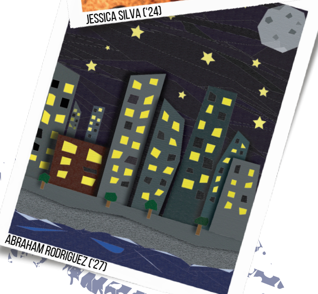
ABRAHAM RODRIGUEZ ('27)